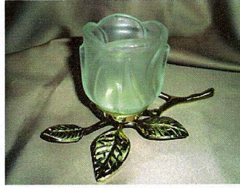
Votive Candle Holder