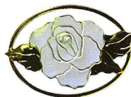
Pristine Rose pin