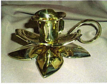
Gold Candle Holder