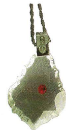
Reflections of Giving pendant