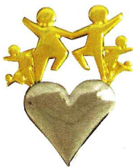
Children on Heart pin