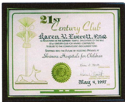
Century Club Certificate