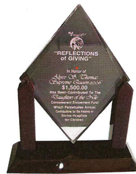
Reflections of Giving