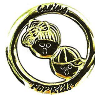
Caring for kids pin