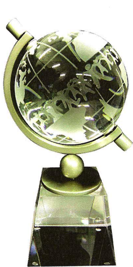
Serving Children around the world