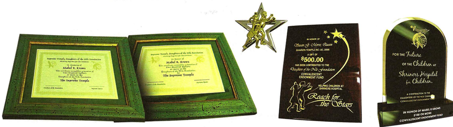
In Memory Of