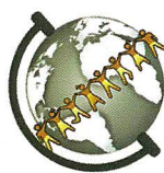
Serving Children around the world pin