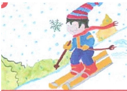
May the Holidays be happy days for you and yours!

This is a wonderful way to send holiday greetings and let friends and family know about the tremendous work done by Daughters of the Nile for Shriners Hos-