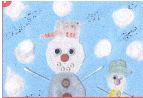
Hope your holidays are filled with merry moments.